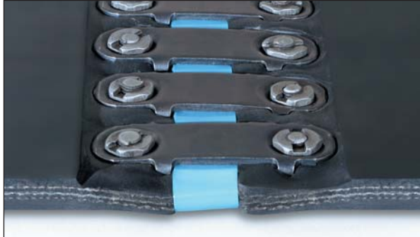
When belt top covers are 3/16" (5 mm) or more, countersinking (recessing) fastener plates is recommended.